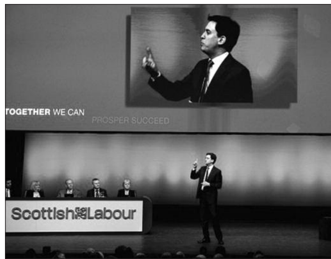
HEX FACTOR: Ed Miliband at Scottish Labour's recent conference

Labour's "socially just" leadership responded that the cap was the "right thing to do".