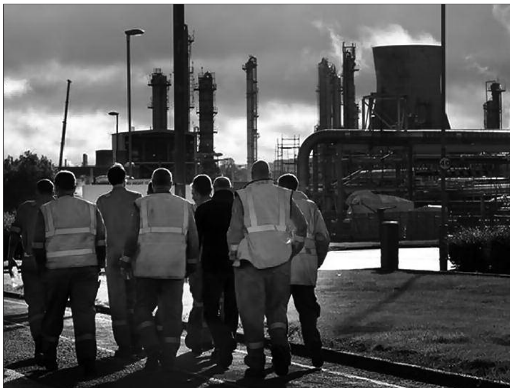
PEOPLE NOT PROFIT: independence, socialism and solidarity should be the watchwords of the union movement

Since the massive recession, London has had twice the growth rates of any other part of