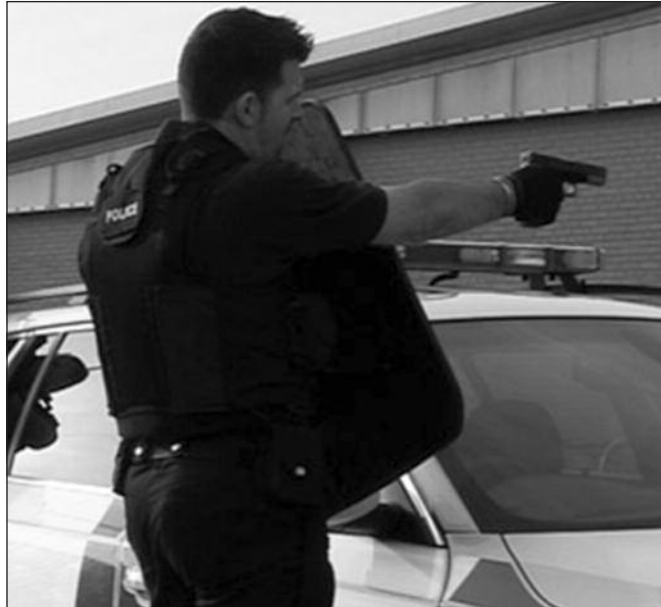
ARMED COPS: in a significant change in operational practice, Highlands armed response officers supporting normal, everyday policing could routinely be on the streets and armed

So, it's closing time for the pubs and clubs in Inverness and among the officers monitoring the crowds dispersing are the armed officer, their