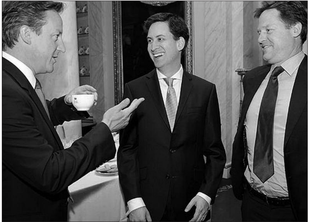
THATCHER'S BRATS: even if Labour defied predictions and won in 2015, what future do they offer workers?

And PCS held an extremely democratic consultation of members, where not one single branch in the whole of Scotland supported the No camp.