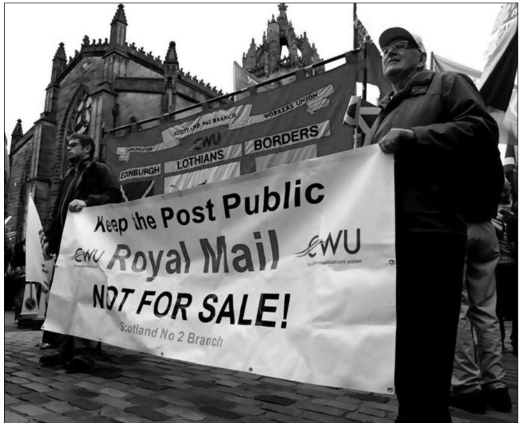
CWU: UK conference decision to call for a No vote flies in the face of the sentiment of Scottish meetings

It is no accident that the leaderships of giant unions like UNITE and UNISON – plus the STUC as a whole – have remained studiously unaffiliated to either the Yes or No campaigns, whilst in fact regularly lacerating Better Together for its lack of vision and failure to persuade workers of any bene-