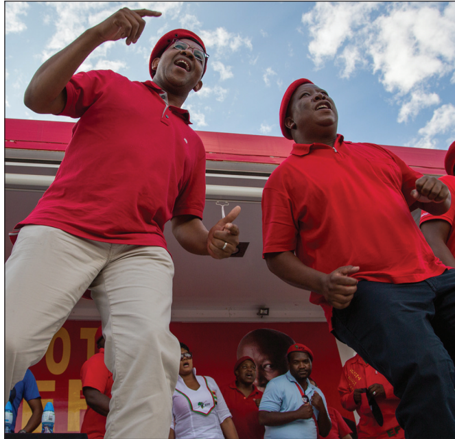
CHALLENGE: former ANC youth leader Julius Malema (right) leads the Economic Freedom Fighters, who polled 6 per cent of the vote

Corruption is rampant and government efforts to clamp down on it have been seriously undermined by the overt personal corruption of President Jacob Zuma who recently spent £23million pounds of government money on his private residence.