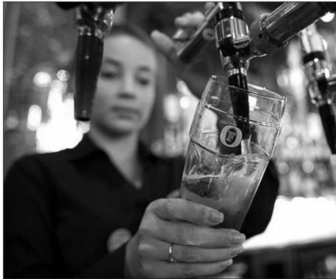
POVERTY PAY: pub chain JD Wetherspoon uses zero hours contracts

Although the zero-hours contract has no legal definition, European legislation broadly divides workers into three categories with different rights and responsibilities: