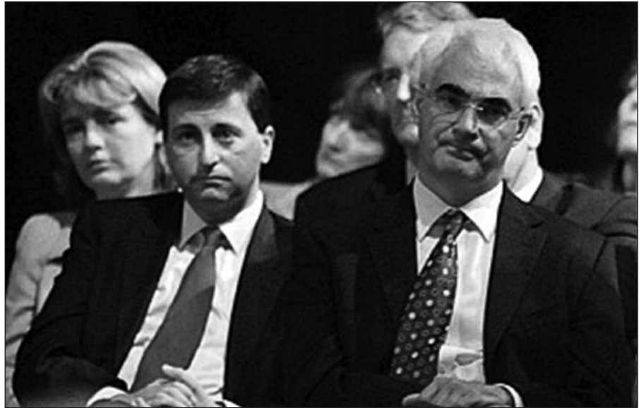
THE GOOD, THE BAD: but the ugly truth is that remaining in the UK is a massive risk for Scots

Better Together while they and their Lib Dem soulmates continue to assault the poor.